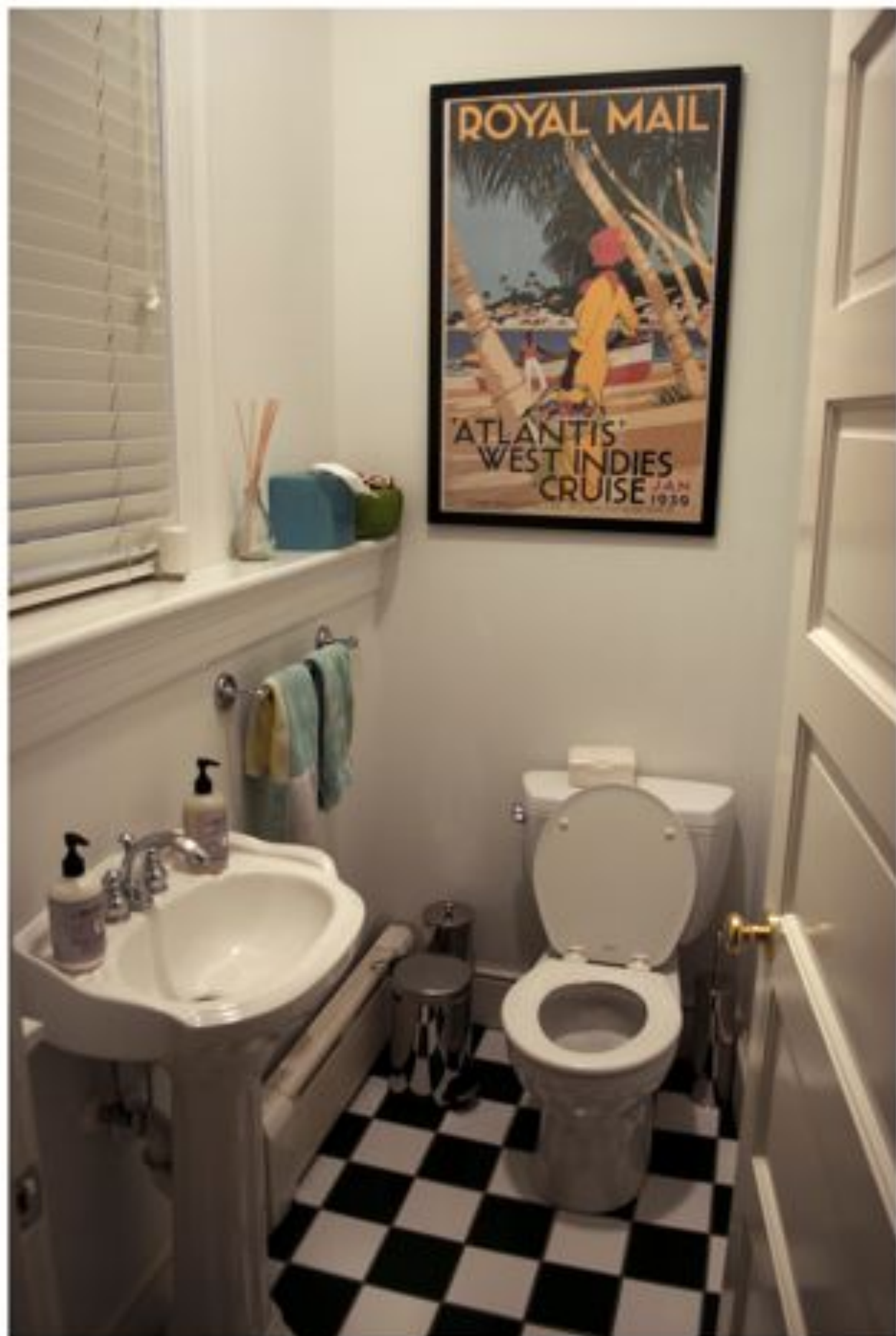
The Nightclub Owner